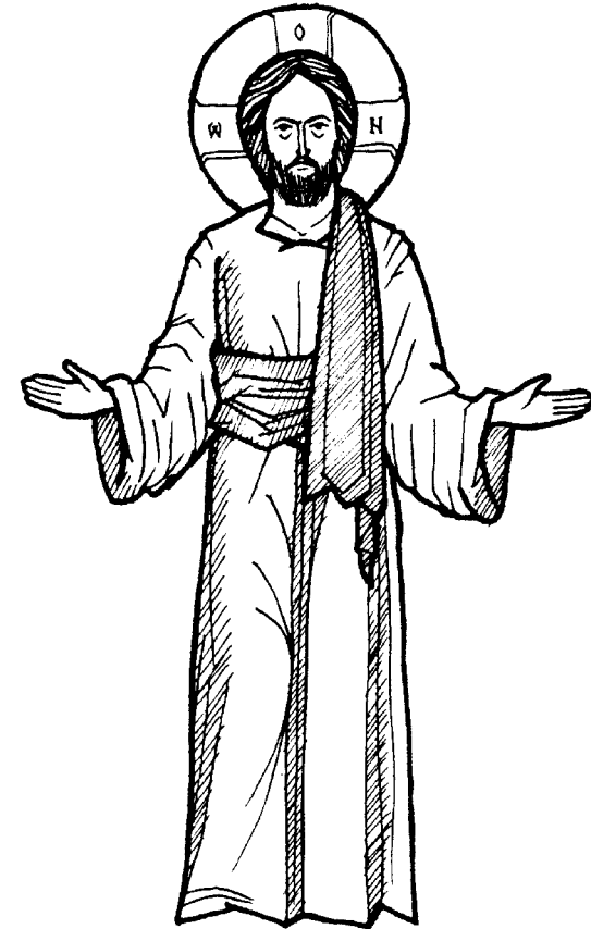
11th Sunday of Matthew

http://www.iocc.org - International Orthodox Christian Charities (IOCC), the official international humanitarian organization of the Standing Conference of Canonical Orthodox Bishops in the Americas (SCOBA).