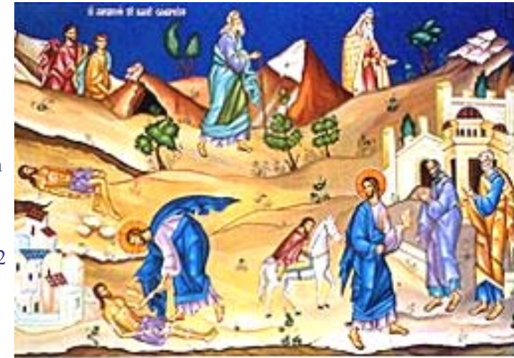
8TH SUNDAY OF LUKE