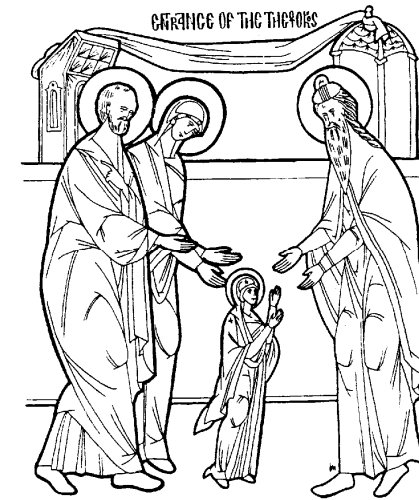
9TH SUNDAY OF LUKE