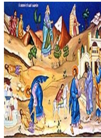
EIGHTH SUNDAY OF LUKE