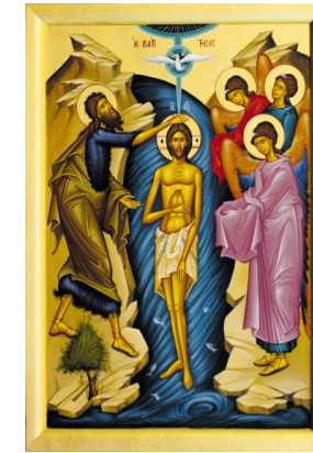
SUNDAY AFTER THEOPHANY