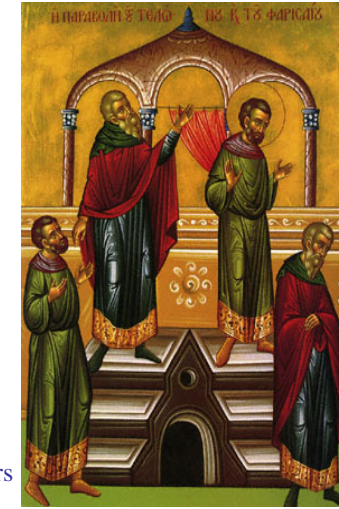
SUNDAY OF THE PUBLICAN & PHARISEE