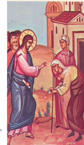
TENTH SUNDAY OF LUKE